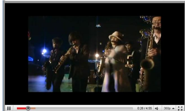
【Others Category: BLACKBLACK618】 http://www.youtube.com/ytjazzjp#p/f/3/snqi8mKvFW0