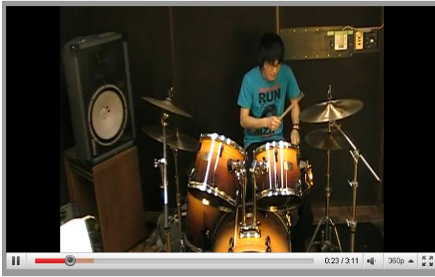
【Drums Category: tinouetanpopo0613】 http://www.youtube.com/y jazzjp#p/f/7/IKtYyjHtIRY