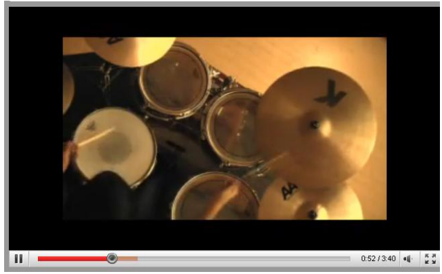
【Drums Category: ryoryo427】 http://www.youtube.com/y jazzjp#p/f/8/QJUrgmiU5Tk