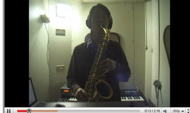
【Horns Category: saxmatsuda】 http://www.youtube.com/ytjazzjp#p/f/6/0F9o2dP3wEc