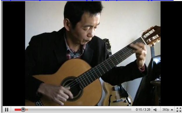
【Guitar Category: storatosabre】 http://www.youtube.com/y jazzjp#p/f/9/11dL5B0emQo