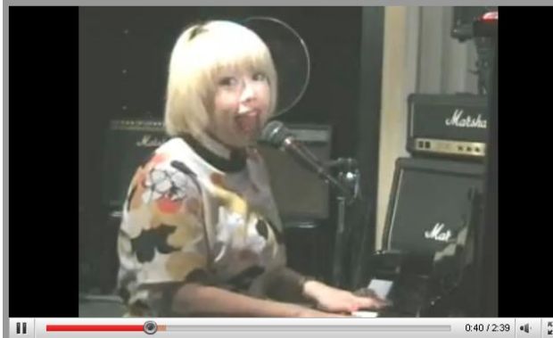
【Vocal Category: dynamitemiki】 http://www.youtube.com/ytjazzjp#p/f/5/zw3Z5JhD3z8