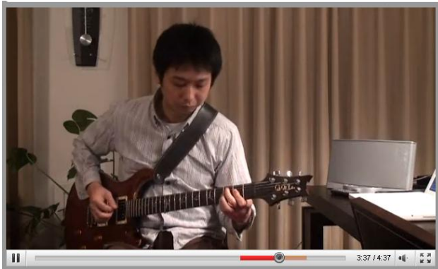
【Guitar Category: naotothebomb】 http://www.youtube.com/ytjazzjp#p/f/1/RAwuMrzFaJY