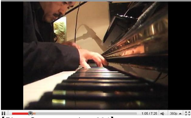
【Piano Category: choro264】 http://www.youtube.com/y jazzjp#p/f/11/DSBPXTzNBII 《Top Vote-Getter Award》