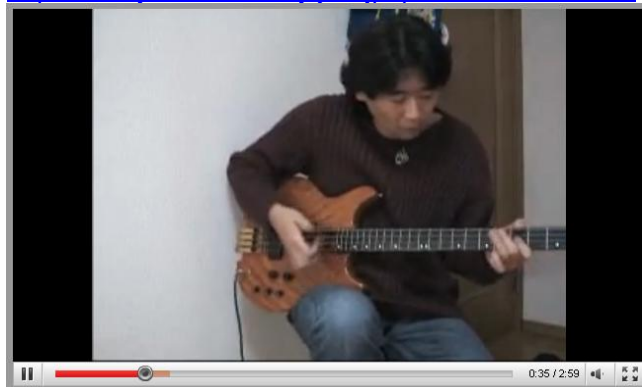
【Bass Category: ASATAKA40】 http://www.youtube.com/y jazzjp#p/f/10/MZfZBVzTJwg