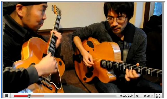
【Guitar Category: acousphere】 http://www.youtube.com/y jazzjp#p/f/2/AhGGHV8jCl0